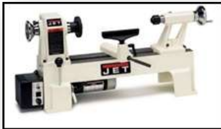
Challenge Prize 2012

December Ornament Earrings (McNeilly Style)