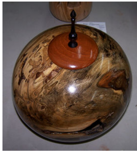
Jerry Ostrander - Maple