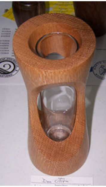
Don Olsen - White Oak