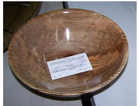
George Wunker - Spalted Maple