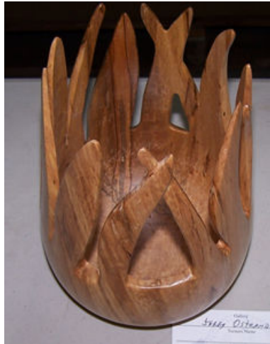
Jerry Ostrander - Maple