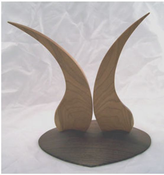
Don Olsen - "Twins" Cherry with Walnut Base