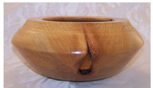
Max Schronce - Sycamore