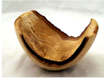
Edgar Ingram - Oak Crotch