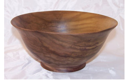
Evanna Brening - Poplar