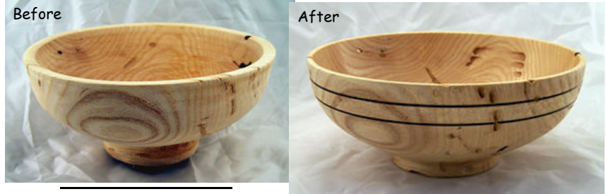
Max Schronce - Ash