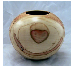
Evanna Brening - Box Elder