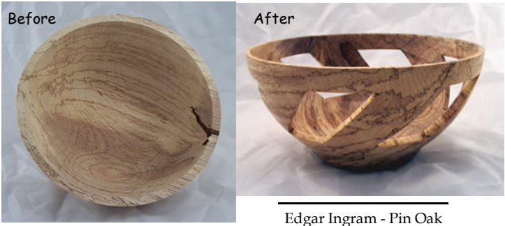
Edgar Ingram - Pin Oak