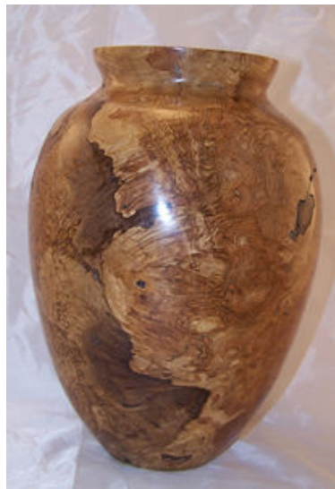
Edgar Ingram - Oak Burl