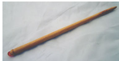
Evanna Brening - Osage Orange Hair Stick