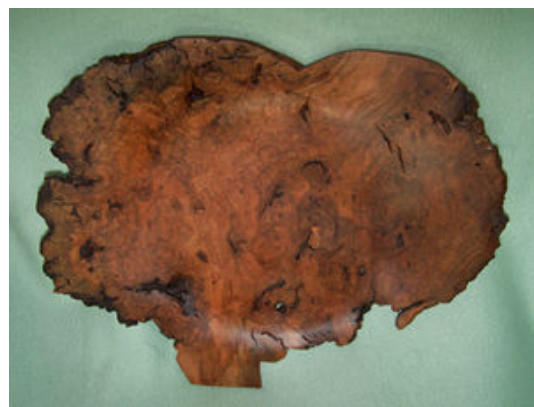
Barb Ward—Cherry Burl platter