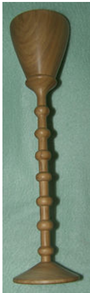
Orville Shook Poplar