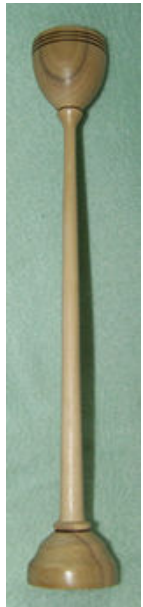
Max Schronce Poplar