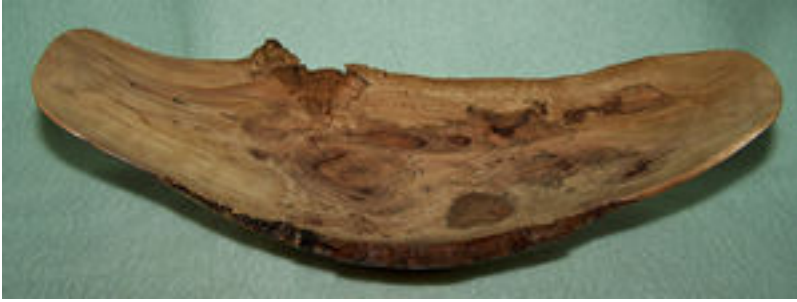
Brad Indicott—Cherry Burl