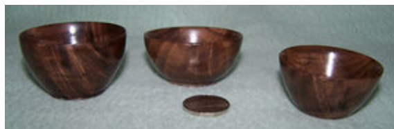
Orville Shook – Walnut