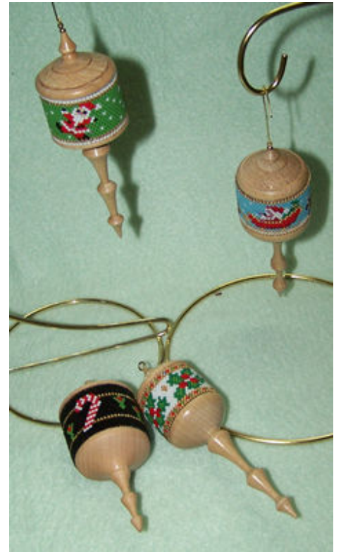
Gary Ritchie—maple & woven glass bead ornaments