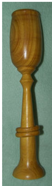
Jim Falowski Osage Orange