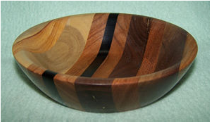
Orville Shook—assorted wood