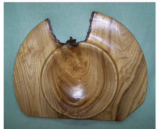
Max Schronce – Chinese Chestnut