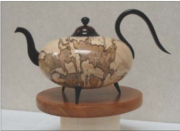
Bruce Hoover - Tea pot