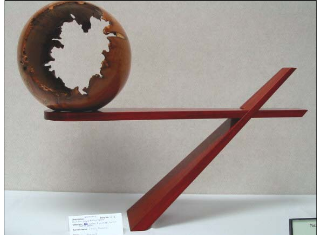
Craig Kasson - balanced sphere