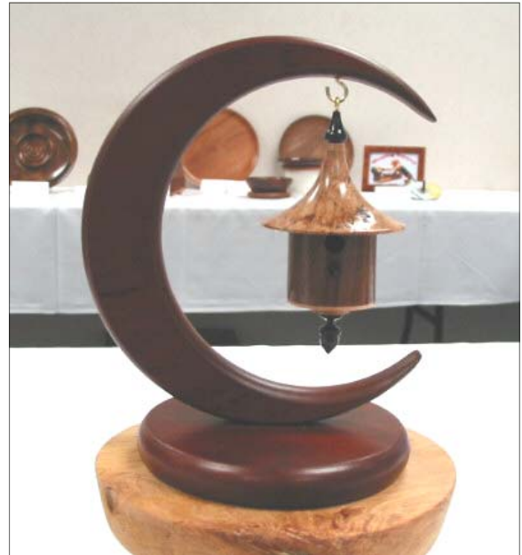
Hanging bird house ornament.