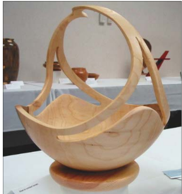
Tom Crabb - Handled Basket