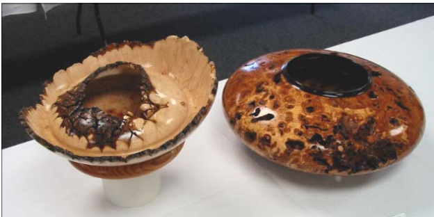
David Woodruff - flawless lacquer finishes