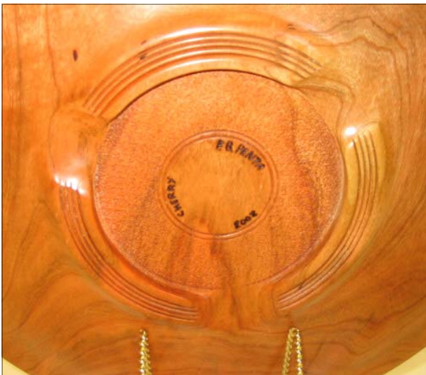
Frank Penta—Detailed and textured foot