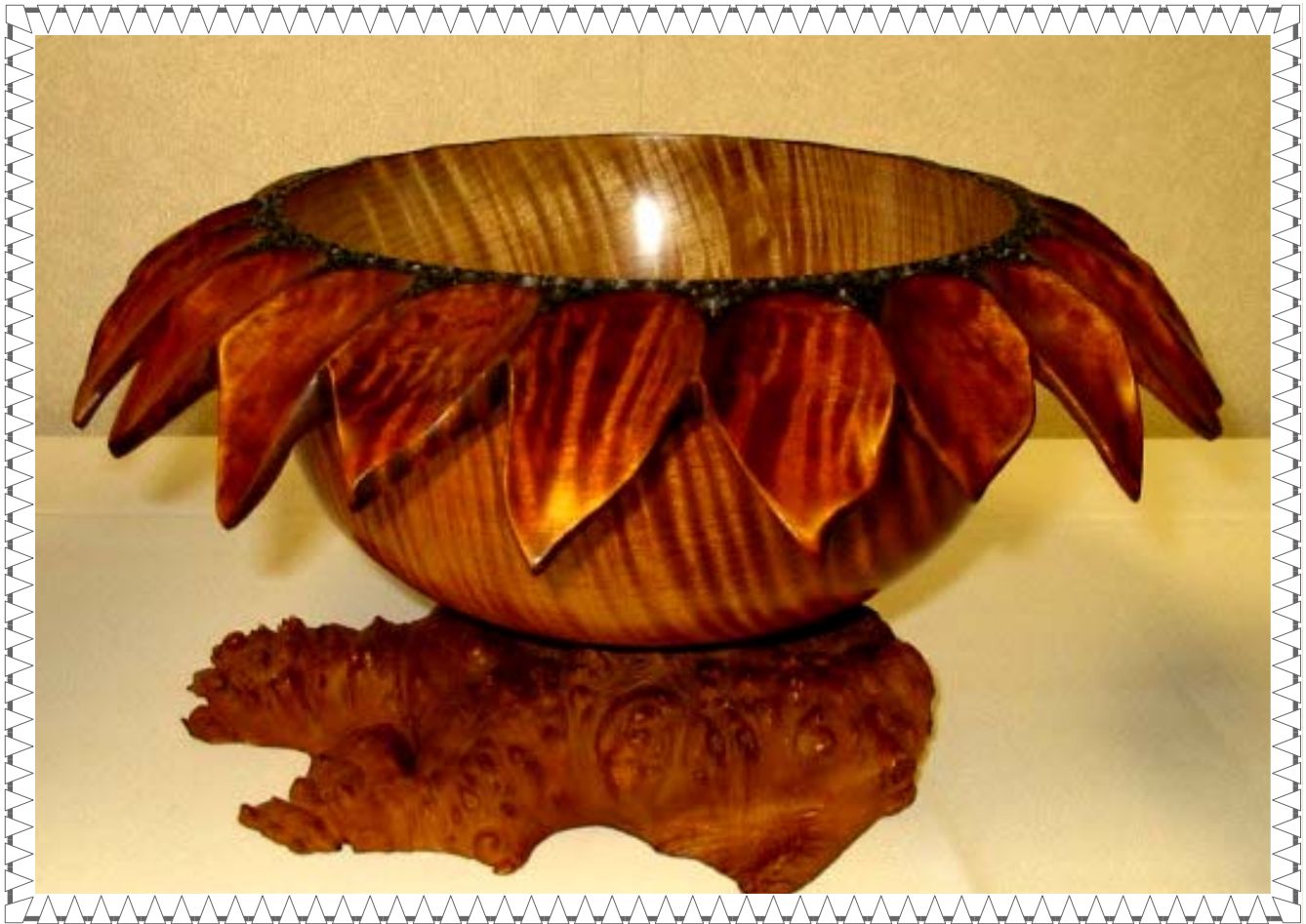
Figured Myrtle - Turned and Carved by Dean Amos