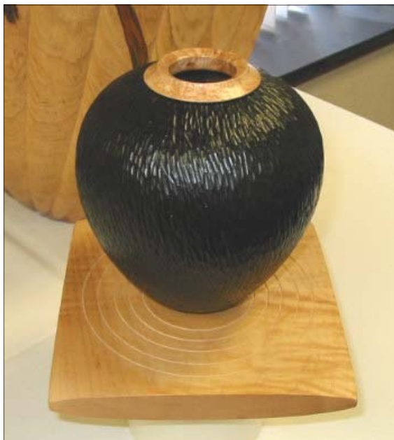
Elvie Jackson - hollowed and textured